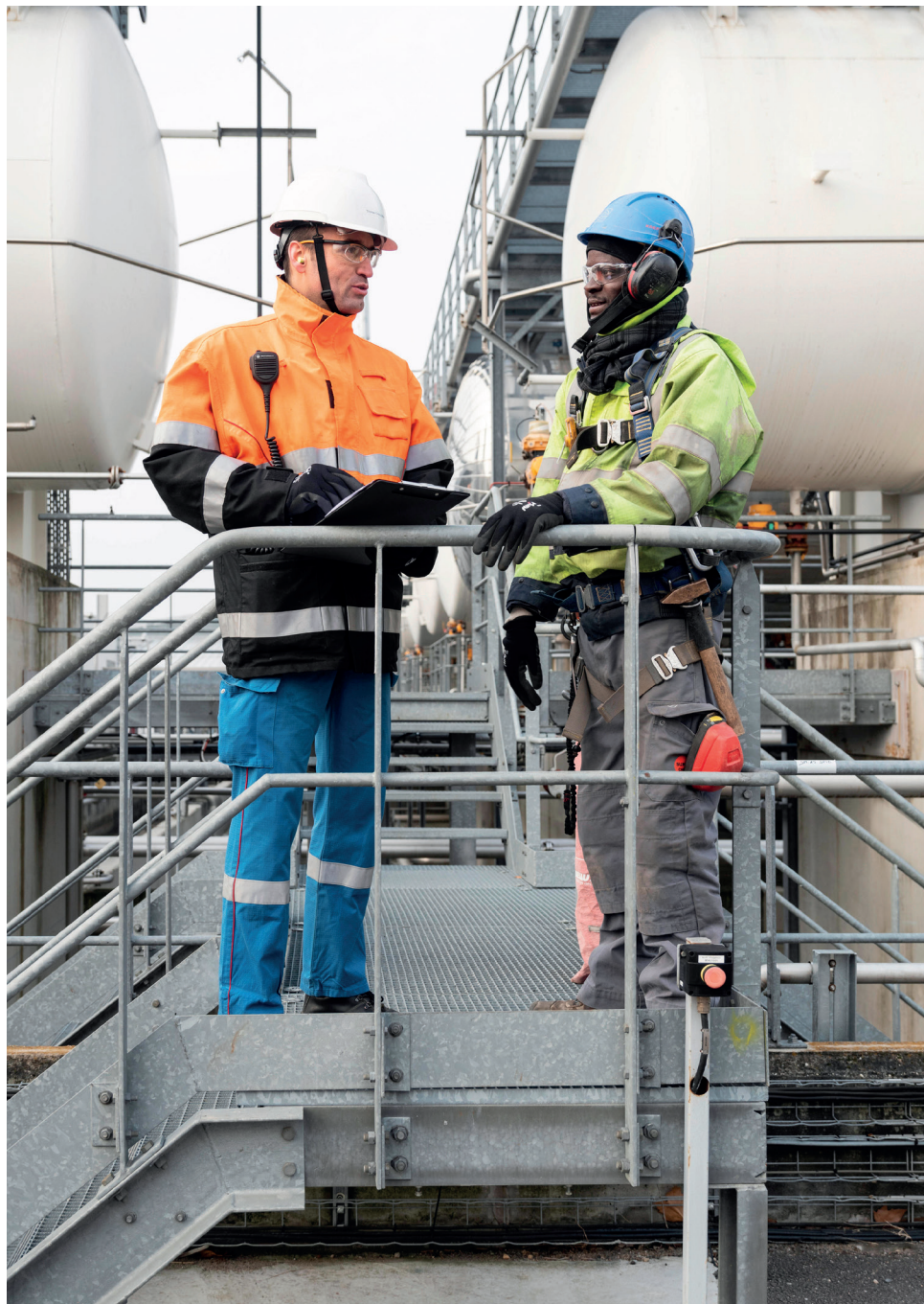
Joint Safety Tours - November 2021