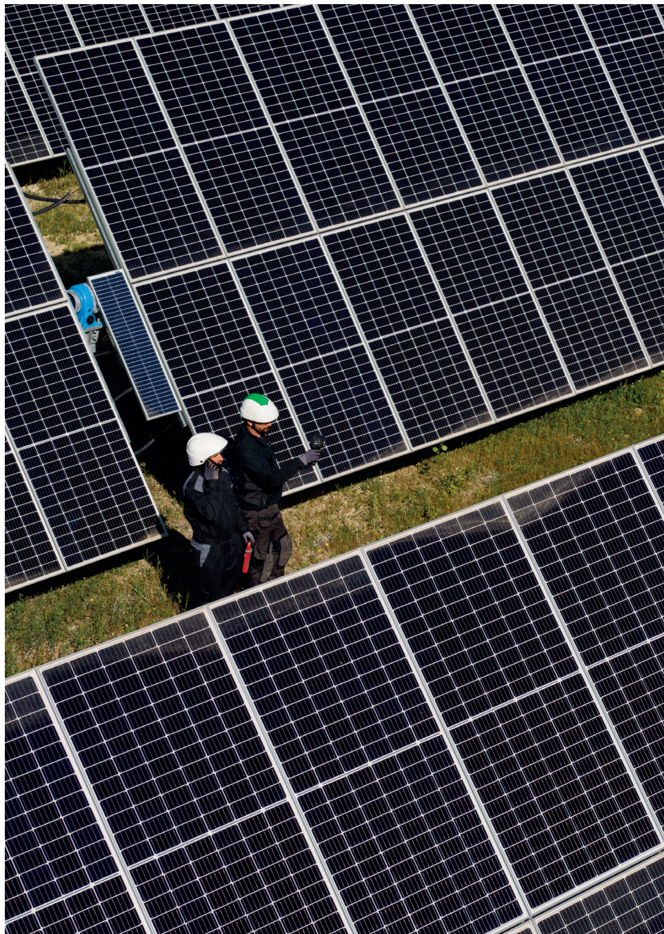
Joint Safety Tours - November 2021